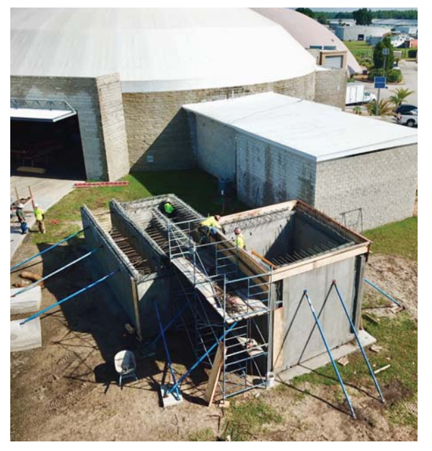
Waveguide design and filter integration for OTS shielded structures